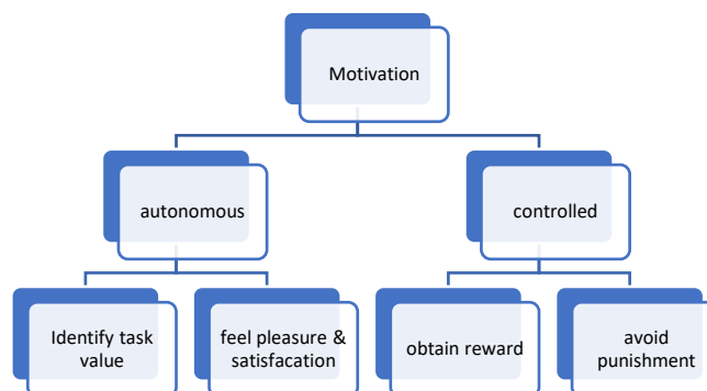
Fig. 1: Causes of autonomous & controlled Motivation.

Though I concede that raising motivation is not an easy job, I still insist that when we raise the extrinsic motivation, we can reach high levels of intrinsic motivation. There are some theories addressing this issue and one among these is the Self-Determination Theory (SDT; DECI & RYAN, [2010]), in which students' perceived competence facilitates autonomous motivation towards learning (DECI & RYAN, [2010]). Therefore, when students feel competent and effective, they tend to engage in school activities more autonomously. In other words, autonomous motivation occurs when students perform a task because of two main reasons: 1-they identify with its importance, and 2- they feel deep-rooted satisfaction and pleasure when doing the task. On the other hand, when they are guided by controlled motivation, they are under pressure to behave in certain ways. For instance, they may perform the task to avoid losing marks. And according to Guay, Ratelle, Roy, & Litalien, autonomous motivation is associated with academic achievement, while controlled motivation leads to anxiety and school dropout (Hardre & Reeve,2003) (see Figure 1).