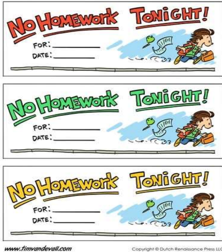
Fig.3: An example of homework passes.

Some of them do not believe in themselves, so they need a lot of encouragement from the teachers, parents, and peers. Some of the students loved external rewards as raffle tickets, fun cash, homework passes, and whole class party. All the previous actions and rewards gave the students more confidence in themselves to accomplish their tasks and to grow as healthy students. Sharing the parents their children's success has a strong impact on the students' performance as well. (See figure 3)