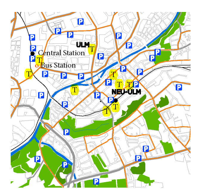
Fig. 1: Transport map in the Ulm-Neu Ulm HSR station area. T. Taxi rank; P. Public car park.

Upon assessment of the city's main attractions and having interviewed local agents, they are placed on the map through a GIS (Geographic Information System) an environment in which the urban bus transport network is represented by the corresponding location of the stations thereof. The objective consists on extrapolating them to the graph by means of which they are represented, which will better allow us to perform a further study of the accessibility and centrality level both of the HSR station and the city's main attractions, as well as their relationship with key elements of the mobility policy: public car parks, other stations or taxi ranks (see Fig. 1).