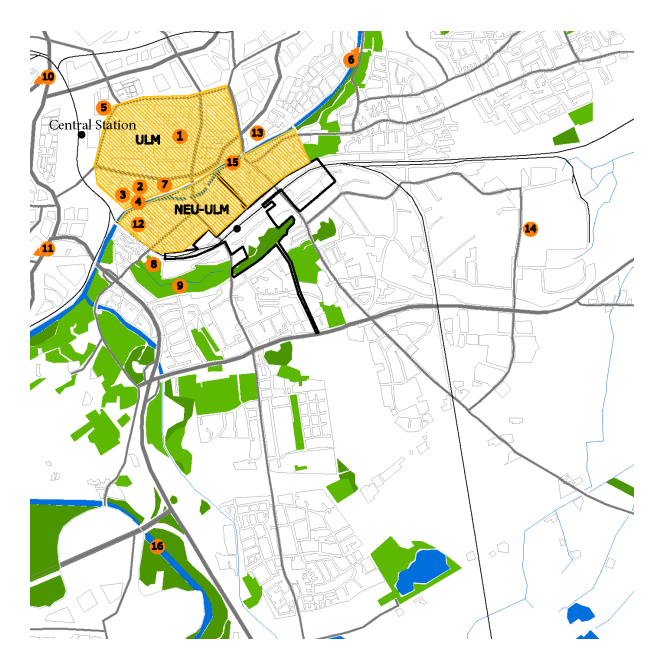
Fig. 2: Ulm-Neu Ulm's Historic Quarter and main attractions.

amount to 196. We are only interested in presenting the possibility to connect the locations or otherwise, and the minimum distances gone through. We are thus representing Ulm-Neu Ulm's valued public transport network by means of a graph (see Fig. 3) and generate the connection matrix between the vertexes.