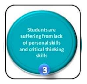
Fig. 3: Challenges Facing Education in KSA https://www.moe.gov.sa/en/Pages/vision2030.aspx

As you can see in the diagram below, the Ministry of Education has indicated that the development of teachers, methods of education, and improving of students' values and skills are some of general objectives of Education 2020.