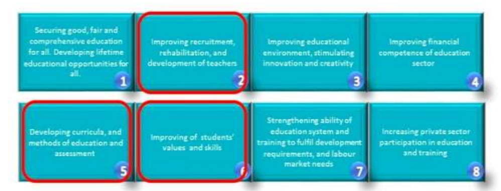
Fig.4: General Objectives of Education 2020

https://www.moe.gov.sa/en/Pages/vision2030.aspx