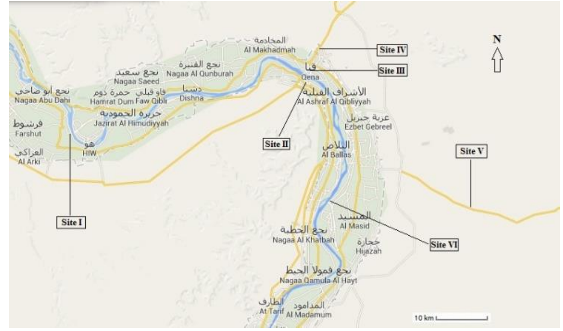
Figure 1. A map of Qena governorate showing the sites of collections.