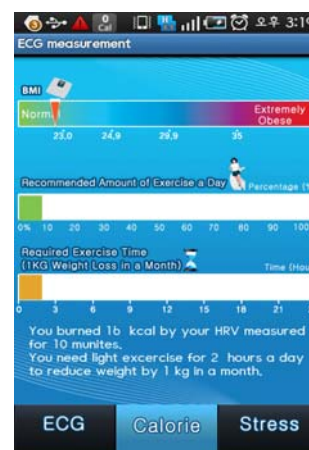
Figure 3.1: An Example of the User Interface in the Calorie Tracker

Following is a description of four key functions in the calorie tracker. First, it obtains and stores ECGs from wellness wear, as well as other general data such as the user's weight, height, age, and gender. In this case, the user inputs these general data into the calorie tracker. The user also has to give the system information as to whether he/she is at rest or active, is taking medications, or is diabetic. The user also wears smart bio-clothes to obtain ECG data, while performing an activity for a certain period of time, say 5 min. Second , the calorie tracker extracts heart-rate variability (HRV) from the ECG, measured over a certain period of time. HRV is a physiological phenomenon in which the interval between heart beats varies.