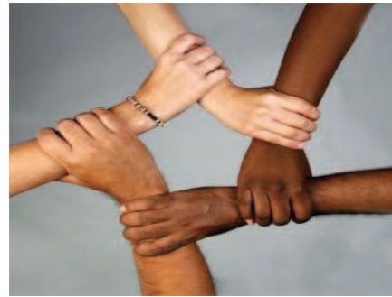
Fig. 1: Samples for human skin

1. Read the image header, BMP head 2. For i = 1 to BMP head height 3. For j = 1 to BMP head width 4. Read pixel Color 5. Mx = \text{Max}(\text{Color} \times R, \text{Color} \times G, \text{Color} \times B) 6. Mn = \text{Min}(\text{Color} \times R, \text{Color} \times G, \text{Color} \times B) 7. \Delta = Mx - Mn 8. If ( Mx = \text{Color} \times R ) then 9. H = (\text{Color} \times G - \text{Color} \times B) / \Delta 10. Else If ( Mx = \text{Color} \times G ) then 11. H = 2 + (\text{Color} \times B - \text{Color} \times R) / \Delta 12. Else 13. H = 4 + (\text{Color} \times R - \text{Color} \times G) / \Delta 14. End if 15. H = H \times 60 16. If ( H < 0 ) then 17. H = H + 360 18. End if 19. If ( T_1 \leq H \leq T_2 ) then 20. Detect pixel as skin 21. End if 22. End 23. End