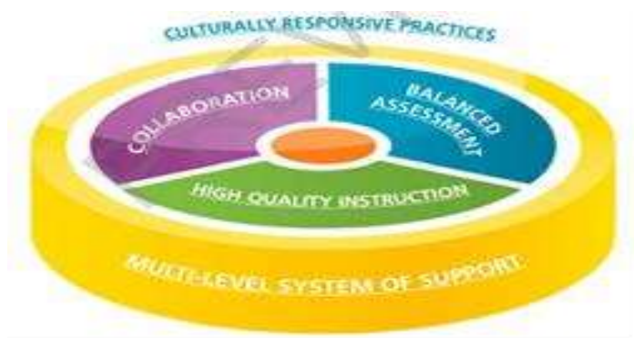
Fig.1: Wisconsin’s Response to Intervention Framework.

Response to Intervention model provides a systems framework for integrated collaboration, instruction, and assessments that better meet the needs of all students (4) . Special education and English Language teachers along with psychologists and other support specialists have a close connection to classrooms teachers to increase communication and the