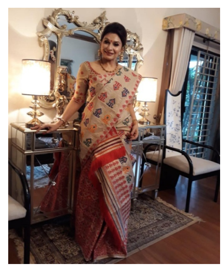
Figure (1) shows a type of Assam Silk.

Assam is very popular for its organic textile industry. It is very ancient industry, especially Assam handloom industry which are based on Eri, Muga and Pat. Such (silk) tread can be found only on Assam, as shown in Figure (1).