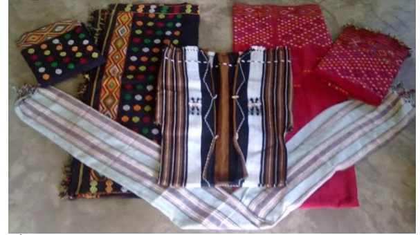
Figure (2) Shows other uses of Assam Silk.

We get this thread from moths, and mullabery leaves are feed to these moths. Traditionally women waves mekhla sador, tribal wears like ribi gaseg dakhna arnai cotton gamusa. Such silk has a particular demand, as such pure silk found only in Assam. Besides this now adays women started to make bags, swalls, chappals and many other product, as show in Figure (2).