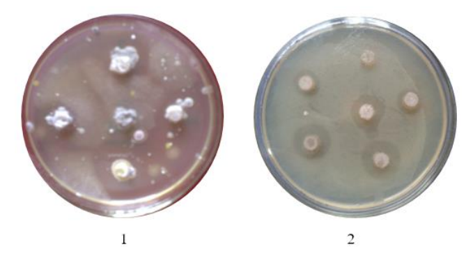
Fig.2: antagonistic property of acidophil (1) actinomyces against E.coli and neutrophil (2) actinimyces against B.mezentericus .

suppress the growth of gram positive St.aureus and B.mezentericus .