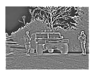
(b) Enhanced IR image E= 2.8655

Fig. 2: Results of the first experiment.