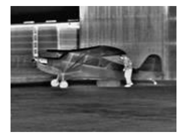
(a)Original IR image E= 1.4753

Fig. 2: Results of the first experiment.