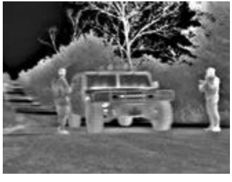
(a)Original IR image E= 1.4605

In this section, two experiments are performed on two different infrared images to test the performance of the proposed enhancement algorithm. The steps of the algorithm mentioned in section (IV) are performed on these two images. For the purpose of evaluation metric for image quality is the entropy of the image. We use the entropy of the image of both the original infrared image and the enhanced one as an assistance tool with the visual evaluation. The results of the first experiment are shown in Fig. (2). Part (a) gives the original infrared image of gives the entropy of the original image before processing and Part (b) of the same figure gives the enhanced infrared image. We remark that the entropy of the original infrared image is 1.4605and the entropy of enhanced infrared image is 2.8655.it's clear the entropy of enhanced infrared image is larger than the entropy of the original infrared image. A similar experiment is carried out on another infrared image and the results are given in Fig. (3). From these results, due to the darkness of IR images, it is expected that their entropy will be small and entropy of enhanced image increased with a maximum of 8 bits. The proposed algorithm has enhanced the visual quality of the processed image as well as its entropy metric. It's shown that this technique has succeeded in the enhancement of the visual quality of that infrared image and more details have been obtained.