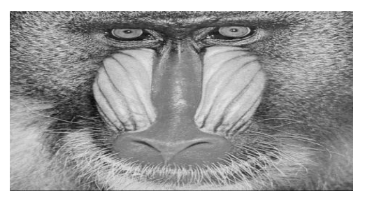
Fig3. b. Baboon