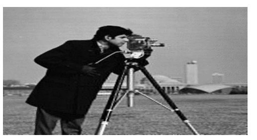
Fig3. f. Cameraman